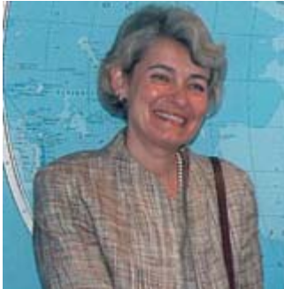
Irina Gueorguieva Bokova

The 58 members of UNESCO's Executive Board on 22 September designated Irina Gueorguieva Bokova (Bulgaria) as candidate to the post of Director-General. On 15 October, the nomination will be submitted for the approval of the General Conference, which brings together representatives of the Organization's 193 Member States. Once confirmed, she will be the first woman Director-General of the Organization.