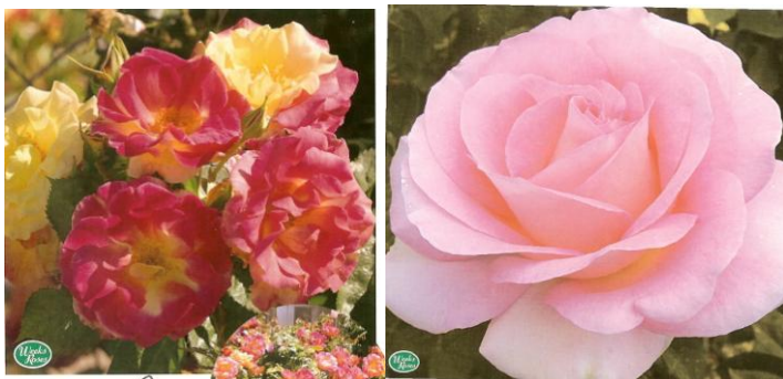
Two of the other 12 rose varieties in the District Rose Sale this year.

Zonta District XV Fall Conference, Frankenmuth October 17-19